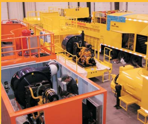
Assembly Bay at the Trecan factory in Nova Scotia, Canada.

Trecan Snowmelters are the most thermally efficient Snowmelters available (approximately 98% efficiency). This is due to the submerged combustion, direct contact method of heating and transferring the energy from the combustion process to the water and snow in the melting tank. With over 35 years of engineering, manufacturing and practical experience Trecan Snowmelters are the most proven, tried and tested Snowmelters available.